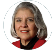
Senate Bill 860 Sen. Judith Zaffirini (D-Laredo)