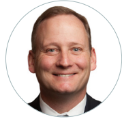
House Bill 10 Rep. Four Price (R-Amarillo)